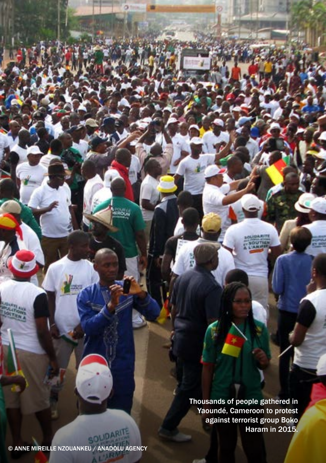
Thousands of people gathered in Yaoundé, Cameroon to protest against terrorist group Boko Haram in 2015.