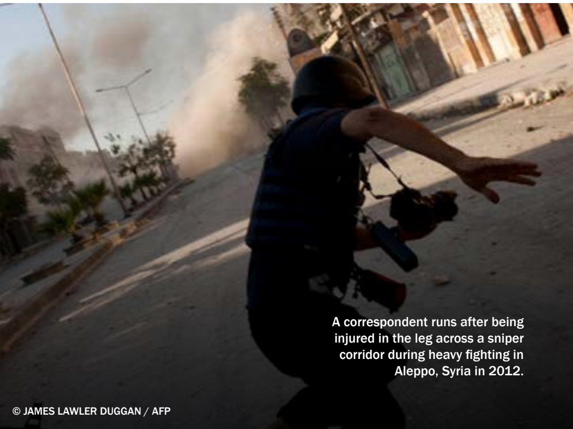
A correspondent runs after being injured in the leg across a sniper corridor during heavy fighting in Aleppo, Syria in 2012.