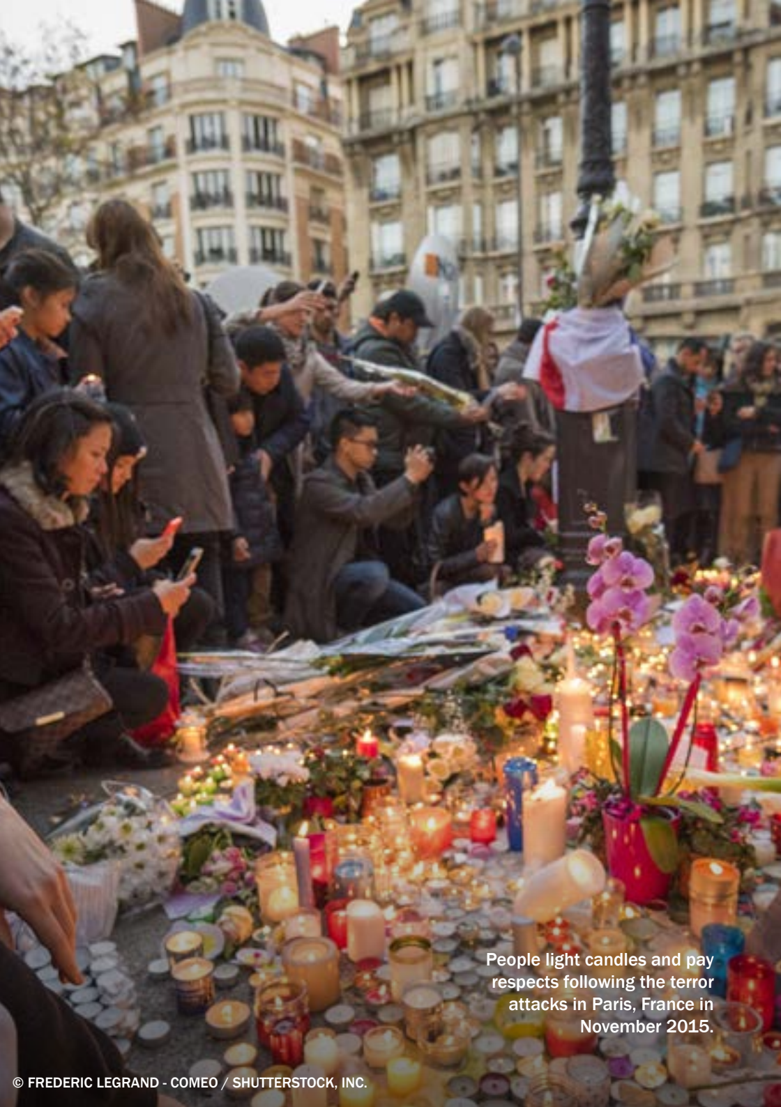
People light candles and pay respects following the terror attacks in Paris, France in November 2015.