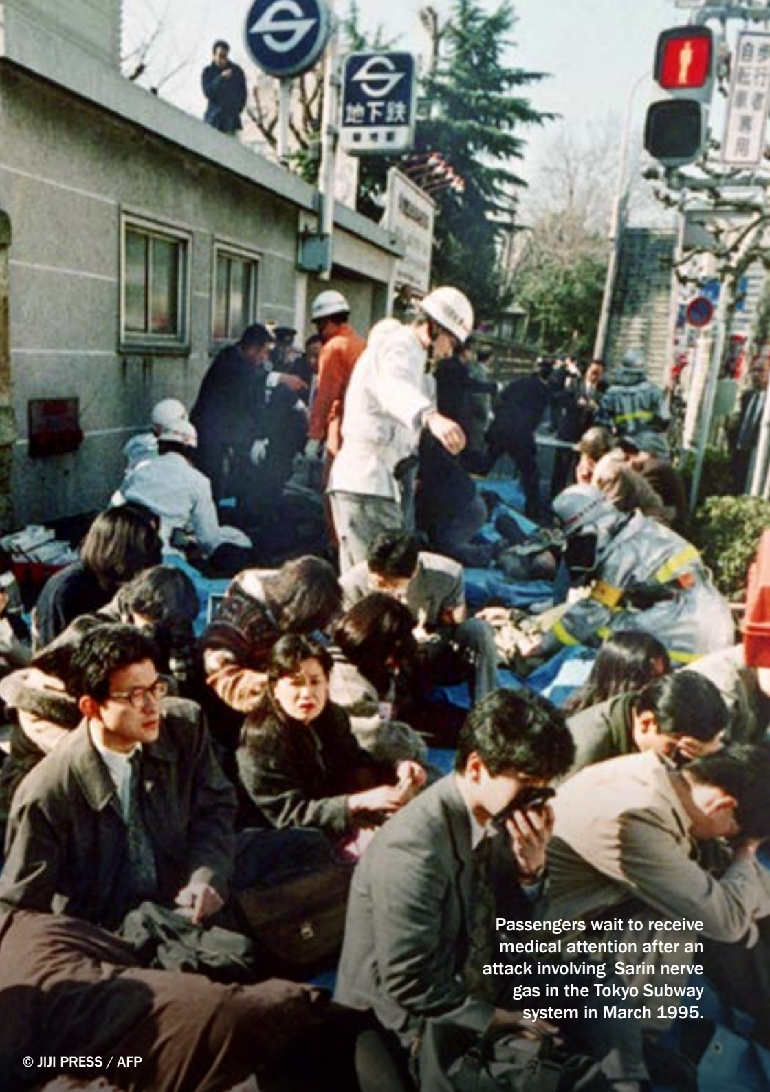
Passengers wait to receive medical attention after an attack involving Sarin nerve gas in the Tokyo Subway system in March 1995.